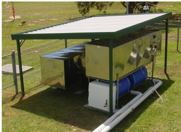
Figure 1a. The radon gradient measurement in the surface layer at Lucas Heights is accomplished using by a pair of 1500L detectors.

Here we report on the first 18 months of hourly observations of the vertical radon gradient from a 50m tower at Lucas Heights. As we are interested in high temporal resolution over the diurnal cycle, the gradient is estimated using two independent radon detectors (Fig. 1). A typical monthly time series of radon measured at 2 and 50m is shown in Fig. 2, which also includes an enlargement of a subsection of the month's data to better demonstrate the results obtained for a wide range of nocturnal atmospheric stratifications (from near neutral to highly stable).