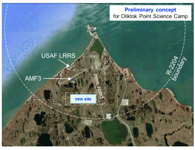
Figure 2. Schematic Plan of Proposed Oliktok Point Science Facility.